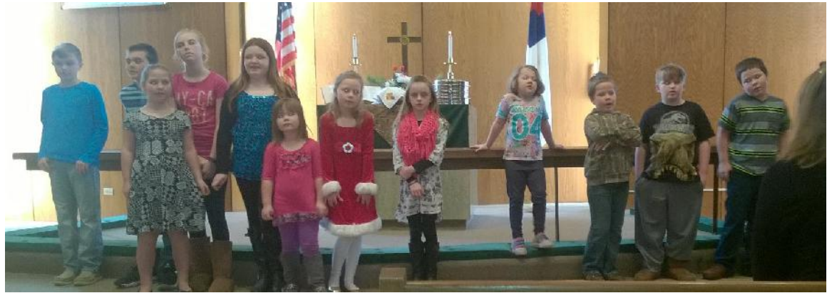
Sunday School singing in church.